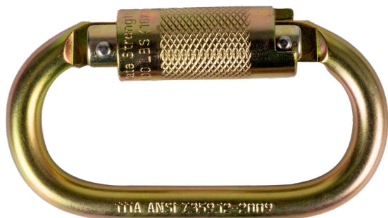
Alternative Option: UFC401101