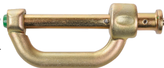
UFC409151 - Side 2