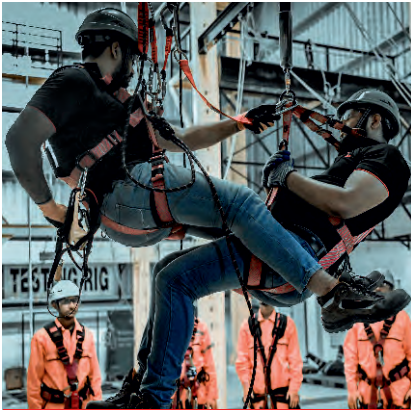
FACILITY IN INDIA

With strategically located training centers KS Group delivers safety training and expertise to a global audience.