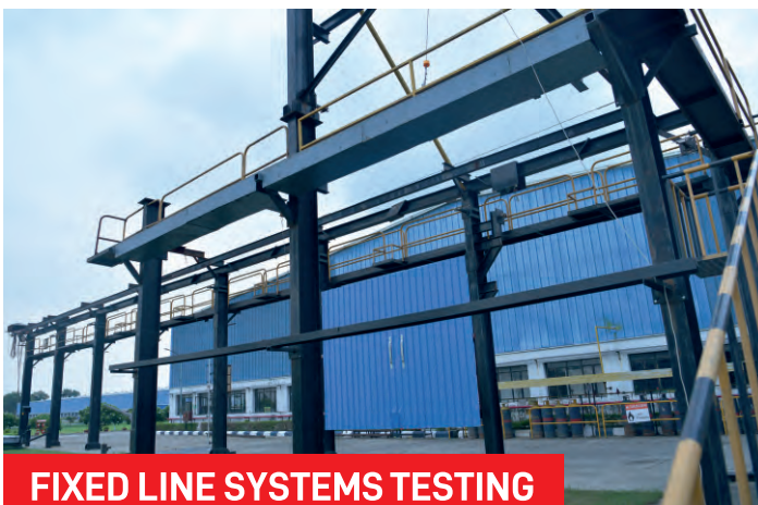
FIXED LINE SYSTEMS TESTING