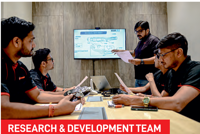
RESEARCH & DEVELOPMENT TEAM

The KS Group has always prioritized understanding customer safety requirements, providing solutions that are tailored to their specific needs. This customer-centric approach is powered by our dedicated Research and Development (R&D) cell, where over 100 engineers and technicians drive constant innovation in product design and process improvement, serving as the backbone for the organization's growth.