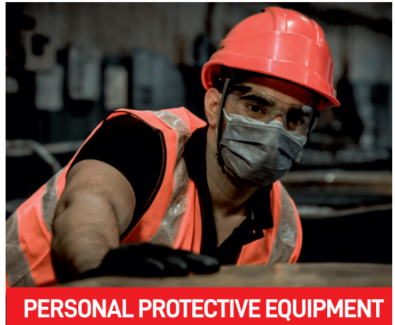
PERSONAL PROTECTIVE EQUIPMENT