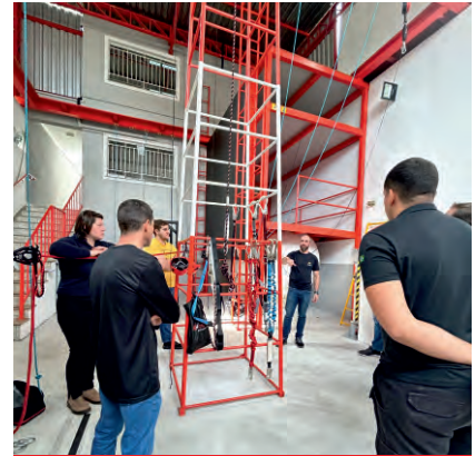
FACILITY IN BRAZIL