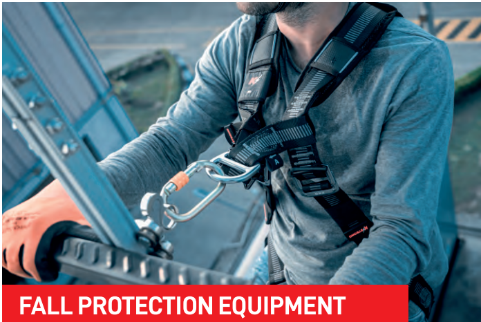
FALL PROTECTION EQUIPMENT