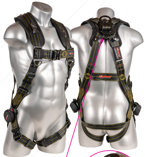
Dorsal D-ring Plus™ Fast, easy, and safe installation of dual SRL connector.