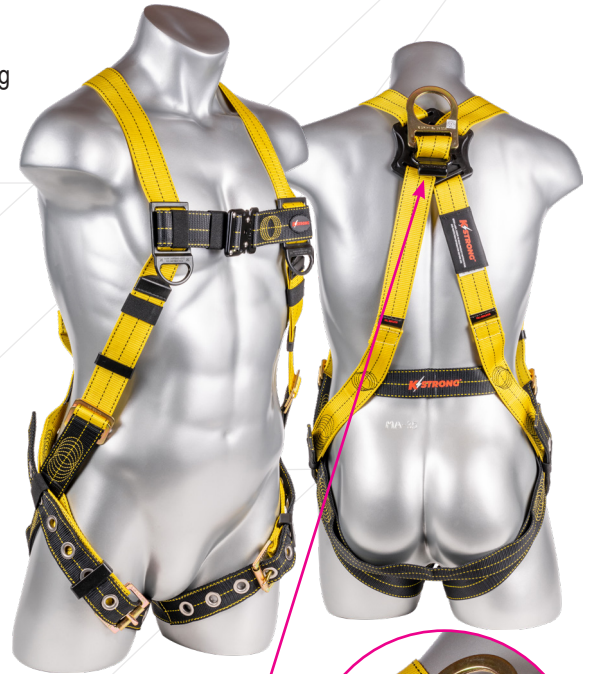
Dorsal D-ring Plus™ Fast, easy, and safe installation of dual SRL connector.