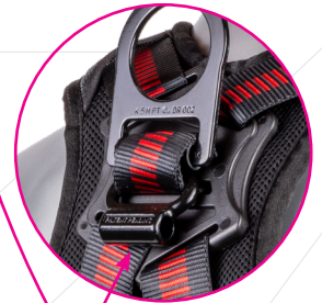
Dorsal D-ring Plus™ Fast, easy, and safe installation of dual SRL connector.