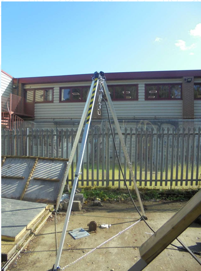
Figure 1 – Anchorage connector described as “UFT510010”