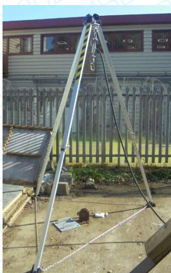
Figure 1 – UFT510010

Full details of test data provided in the following report: SPC0288113/1931 Issue 4 Ext 1 dated 3 rd September 2020