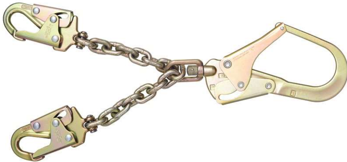
Figure 2 – Lanyard/positioning lanyard described as “UFL205401”