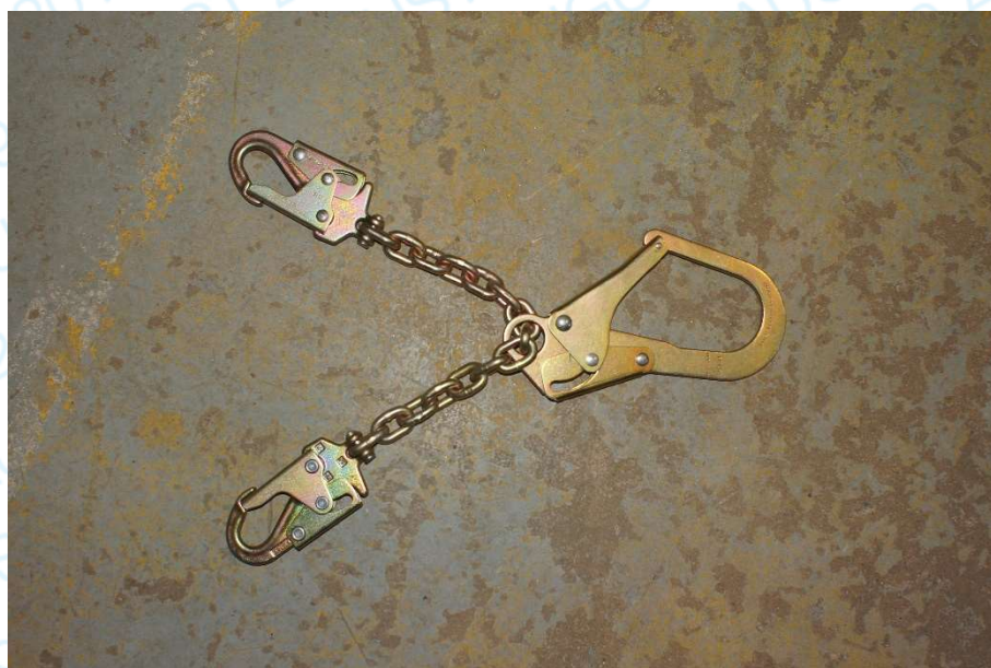
Figure 1 – Lanyard/positioning lanyard described as “FAP 30598”

Samples were tested as received, and were not subject to any pre-conditioning processes other than those stated in individual test clauses