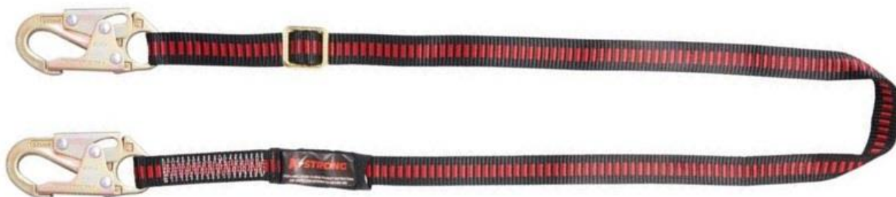
Figure 1 – Lanyard/positioning lanyard described as “UFL205215”

Samples were tested as received, and were not subject to any pre-conditioning processes other than those stated in individual test clauses