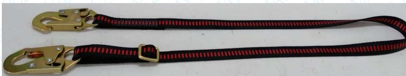
Figure 2 – Lanyard/positioning lanyard described as “UFL205211”