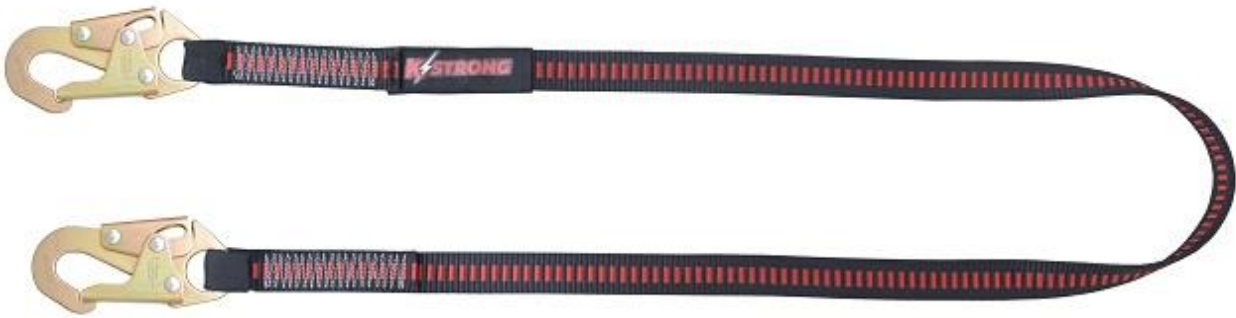
Figure 3 – Lanyard/positioning lanyard described as “UFL205201”