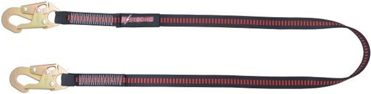
Figure 3 – Lanyard/positioning lanyard described as “UFL205201”