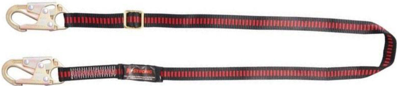
Figure 1 – Lanyard/positioning lanyard described as “UFL205215”

Samples were tested as received, and were not subject to any pre-conditioning processes other than those stated in individual test clauses