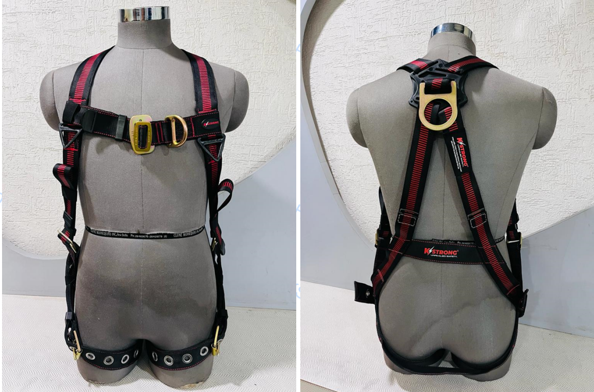
Figure 1 – Harness described as “UFH10211G”

SATRA Report Reference: SPC3062T1H5 2337