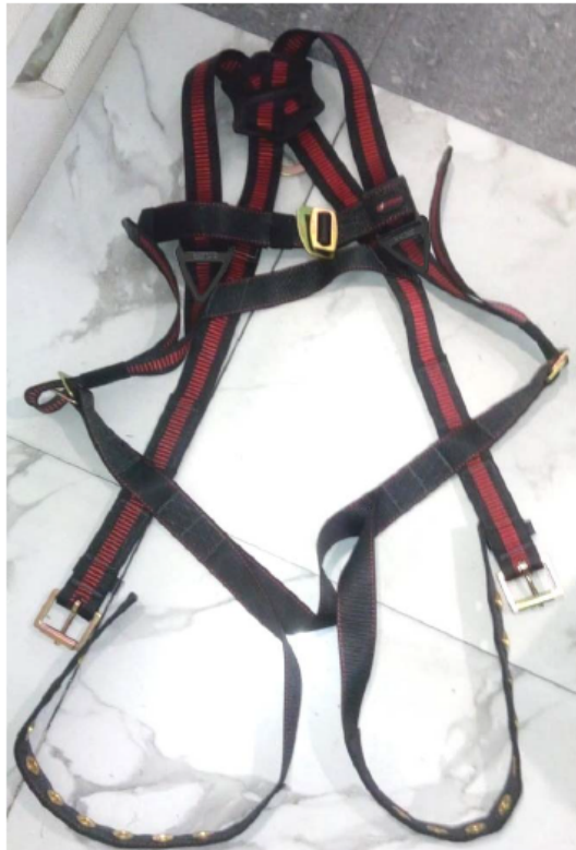
Figure 2 – Harness described as “UFH10201G”