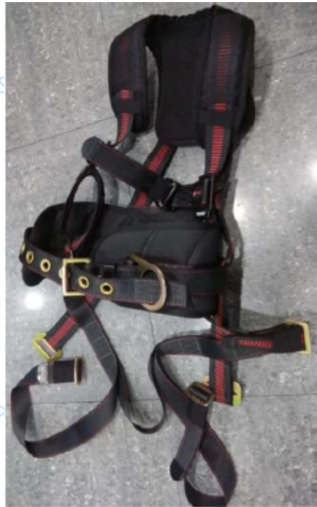
Figure 1 – Harness described as “UFH10331P”