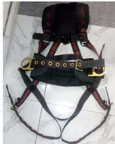
Figure 2 – Sample referenced as UFH10331G