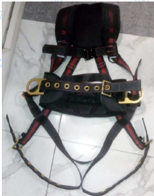
Figure 2 – Harness described as “UFH10331G”