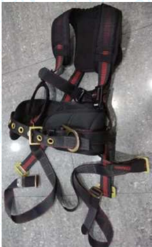
Figure 1 – Sample referenced as UFH10331P

Full details of test data provided in the following report: SPC7810H6T0 /2348 dated the 28/11/2023