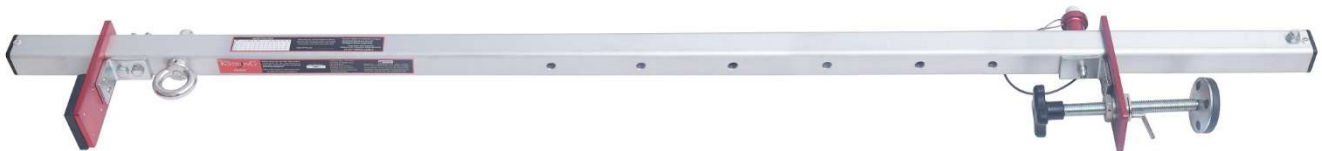
Figure 1 – Anchorage connector described as “UFA30401”

Samples were tested as received, and were not subject to any pre-conditioning processes other than those stated in individual test clauses