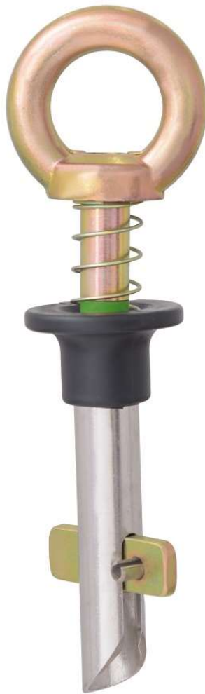
Figure 1 – Anchorage connector described as “UFA30080”