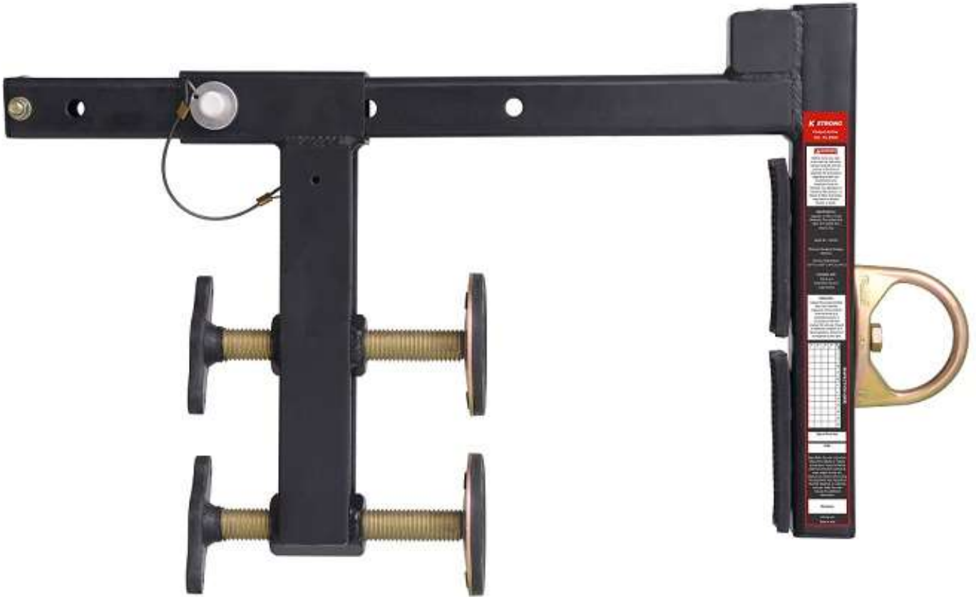
Figure 1 – Anchorage connector described as “UFA30070”