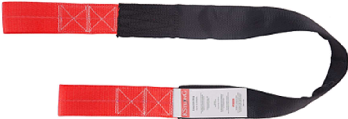
Figure 1 – Anchorage sling described as “UFA21004”