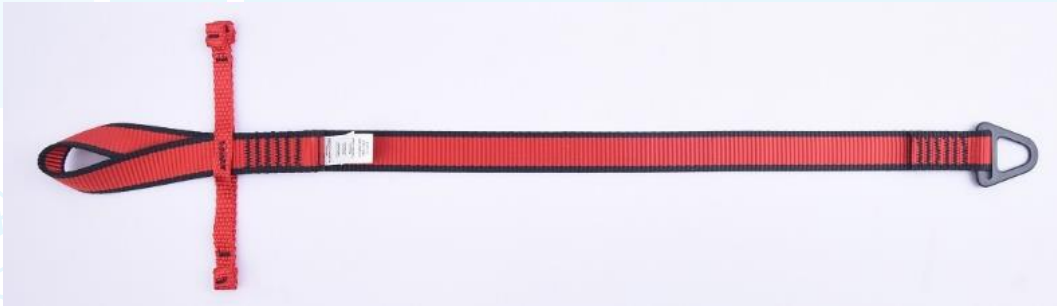
Figure 2 – Tool tether described as “DL200201”