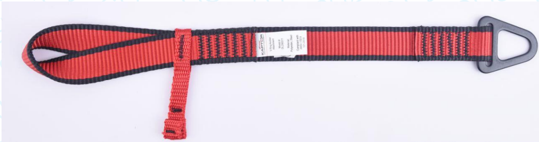
Figure 3 – Tool tether described as “DL200311”