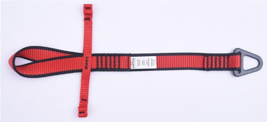
Figure 1 – Tool tether described as “DL200101”