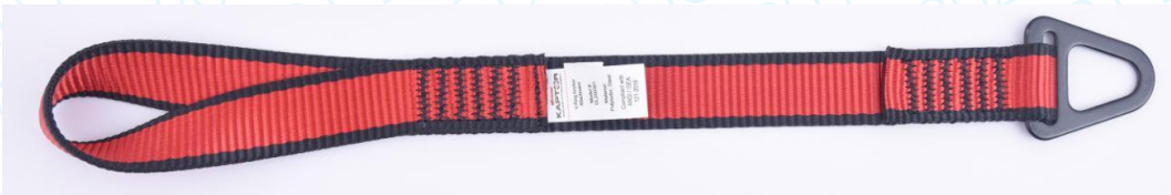
Figure 4 – Tool tether described as “DL200301”