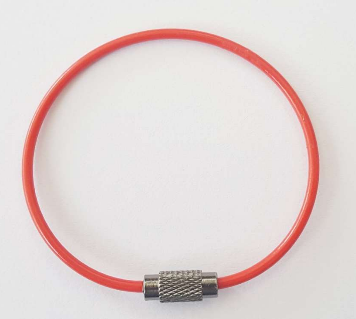
Figure 1 – Sample referenced as DL100802

Full details of test data provided in the following report: SPC0328323 /2211 dated the 28th March 2022