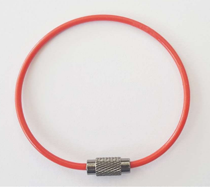
Figure 1 – Tool tether described as "DL100802"