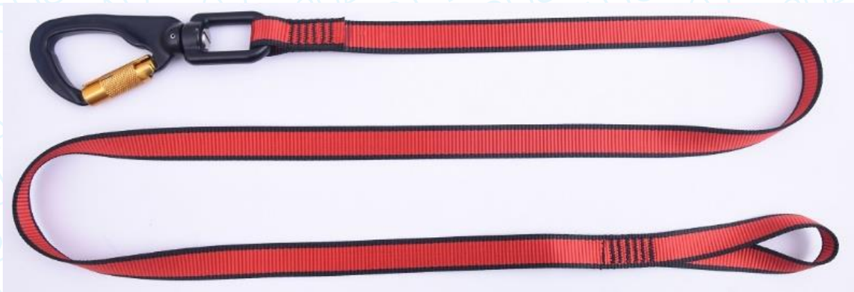
Figure 1 – Tool tether described as “DL100711”