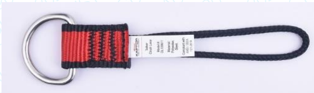
Figure 1 – Tool tether described as “DL100611”