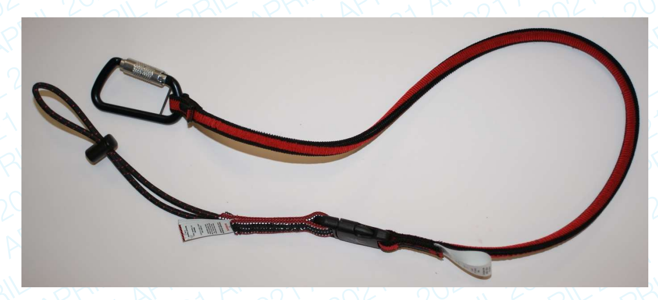
Figure 1 – Tool tether described as "DL100401" (made from the combination of components "DL100201" & "DL100400")

Full details of test data provided in the following report: SPC0303678 /2042 Issue 4 Ext 1 dated the 23<sup>rd</sup> April 2021