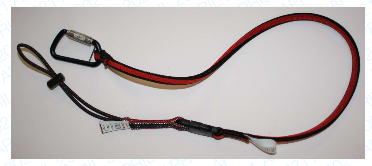
Figure 1 – Tool tether described as "DL100401" consisting of components "DL100400" & "DL100201"