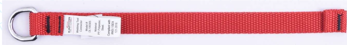
Figure 1 – DL10030X where X denotes variant length

Full details of test data provided in the following report: SPC0326047 /2205/1 dated the 3 rd February 2022