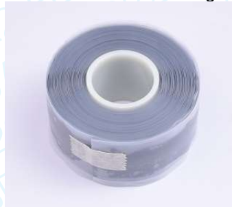
Figure 3 – Tool tape described as "DT700101"