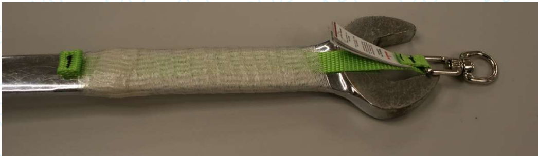
Figure 4 – Tool attachment described as " DL100351" fixed to the test mass using “DT700101”