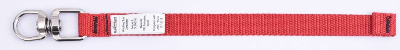
Figure 2 – Tool attachment described as "DL10035X" where X denotes length