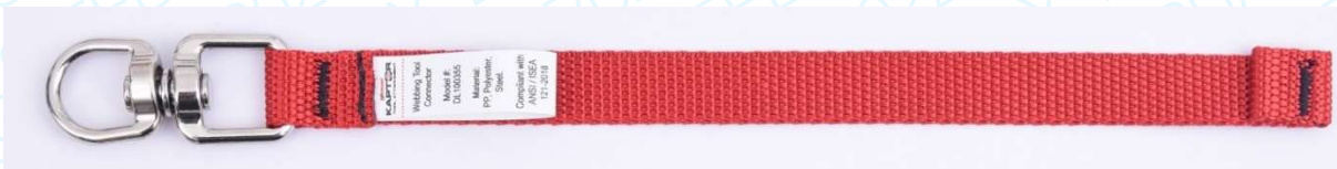
Figure 2 – DL10035X where X denotes variant length