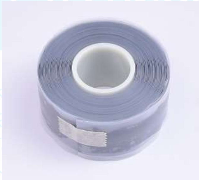
Figure 3 – Tool tape described as “DT700101”