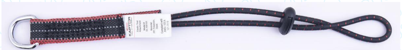
Figure 1 – Tool tether described as “DL100101”