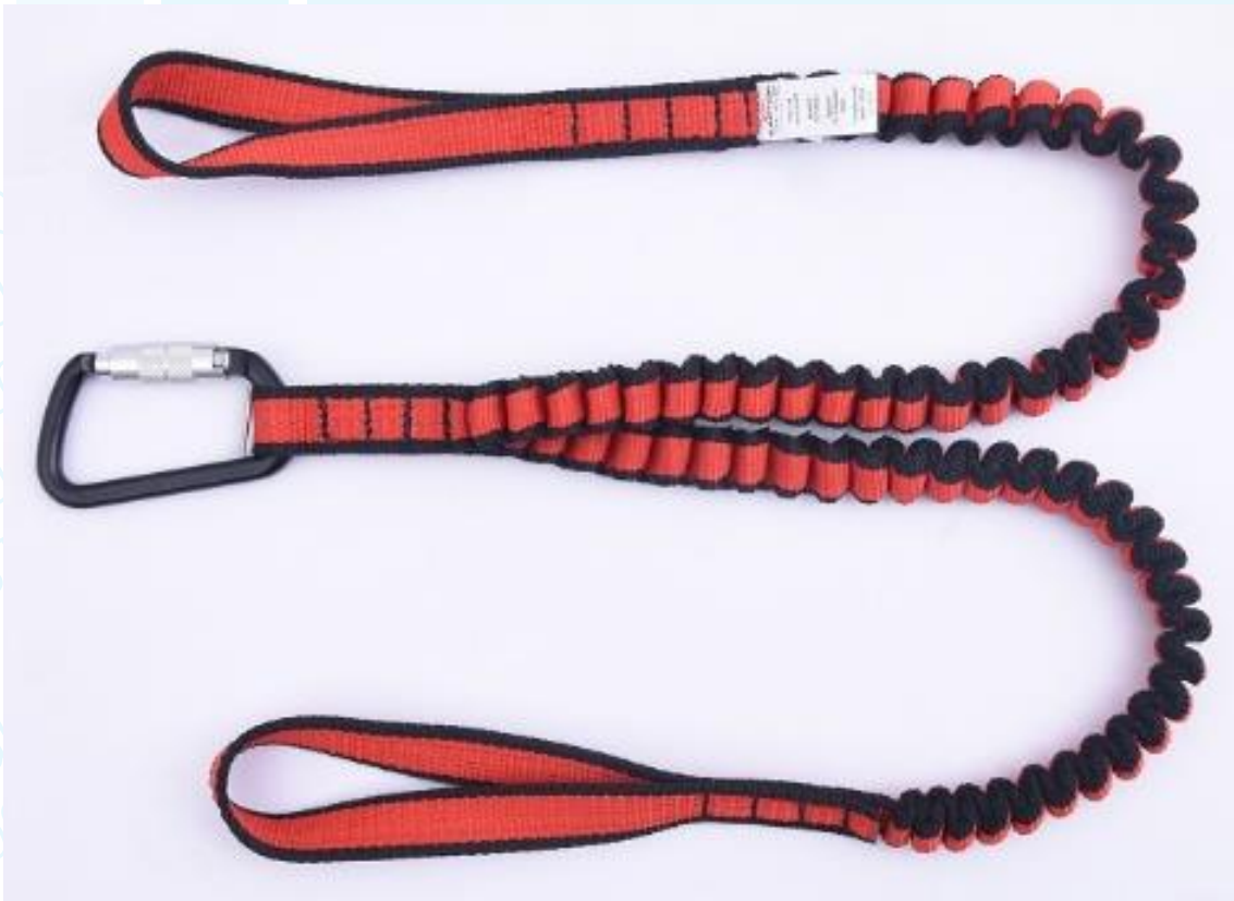
Figure 2 – Tool tether described as “DL10042”