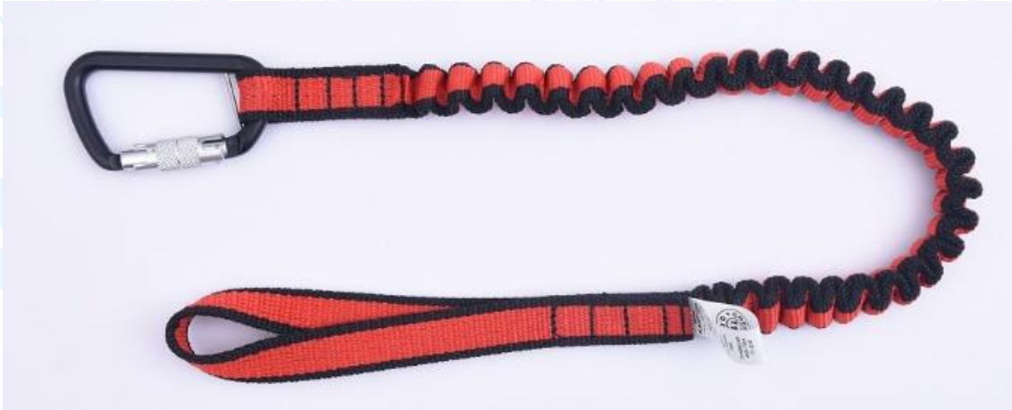
Figure 1 – Tool tether described as “DL10041”