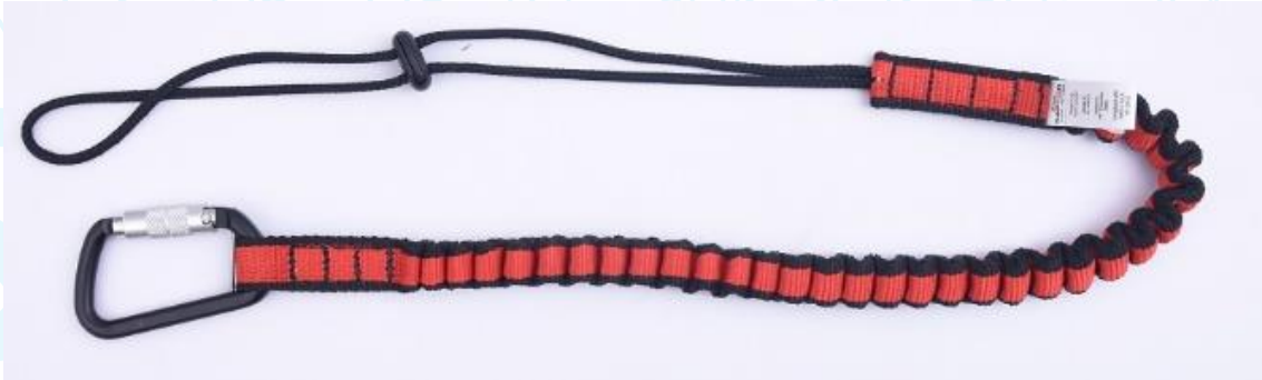
Figure 1 – Tool tether described as “DL100021”