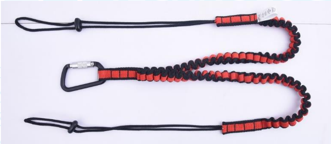
Figure 2 – Tool tether described as “DL100022”