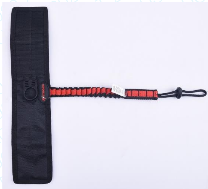
Figure 1 – Tool tether described as “DA300411”