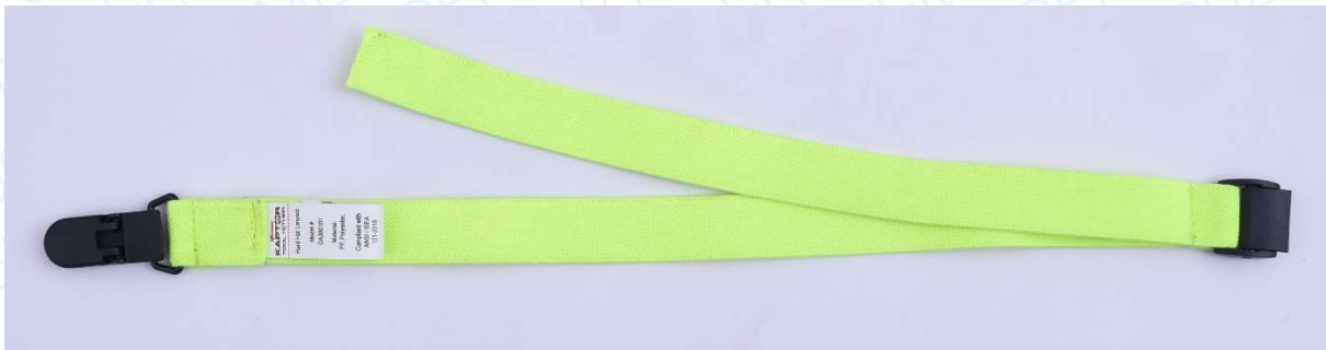
Figure 1 – Tool tether described as “DA300101”