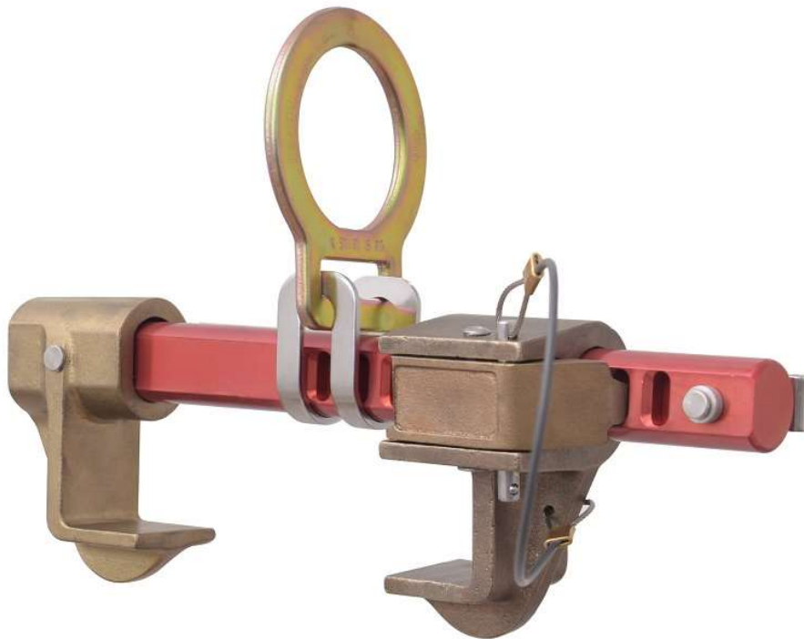
Figure 2 – Anchorage connector described as “UFA30115”