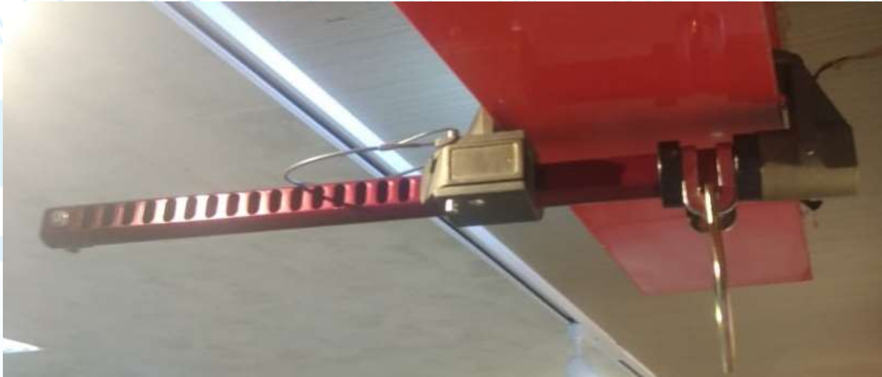
Figure 1 – Anchorage connector described as “UFA30110”