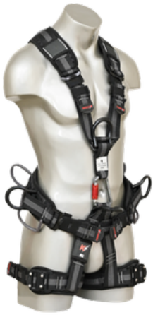
EPIC RESCUE HARNESS C/W ALUMINIUM FRONT & REAR D-RINGS, WORK POSITIONING WAIST BELT WITH SIDE D-RINGS, EQUIPMENT TOOL LOOP (ANH300404)