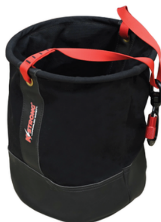
TOOL BUCKET 55KG (45CM HIGH X 35CM WIDE) (DB50051)