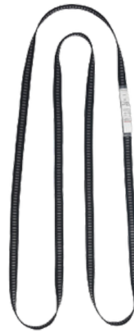
ANCHOR STRAP 23KN (AFA921515(1.5M))