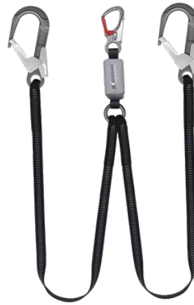
EPIC SHOCK ABSORBING LANYARD TWIN LEG 140KG 30MM WEBBING 2M C/W ALUMINIUM SNAP HOOK & ALUMINIUM SCAFFOLD HOOKS AT OTHER END (ANL406650)