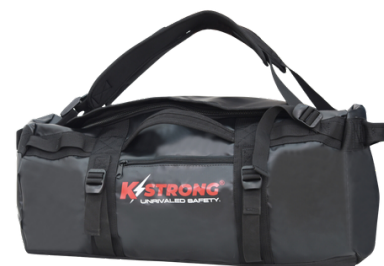
DUFFLE BAG WATERPROOF 40L (AFZ177197)