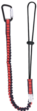
ELASTICATED TOOL LANYARD RELAXED 89CM - EXPANDED 1.34M SWL 10KG (DL100021)