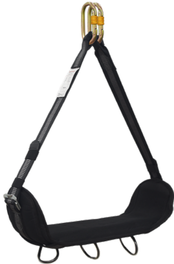
IRSQ EASY SEAT (AFX201001)