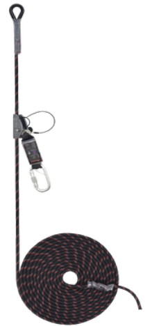
TEMPORARY VERTICAL ANCHORAGE LINE SYSTEMS C/W SHOCK ABSORBER AND KARABINER (ANA951225)