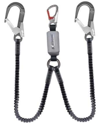
EPIC ELASTICATED SHOCK ABSORBING LANYARD TWIN LEG 140KG 2M C/W ALUMINIUM SNAP HOOK & ALUMINIUM SCAFFOLD HOOKS AT OTHER END (ANL408341)