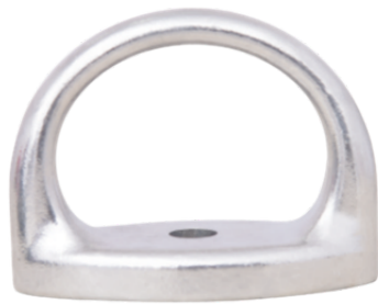
SINGLE STAINLESS STEEL ANCHOR POINT (AFA930001SS)