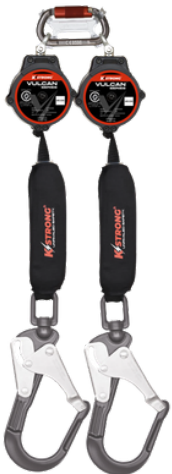
TWIN MICRON SRL 2 METER C/W ALUMINIUM SWIVEL SCAFFOLD HOOK (AFS550028D)