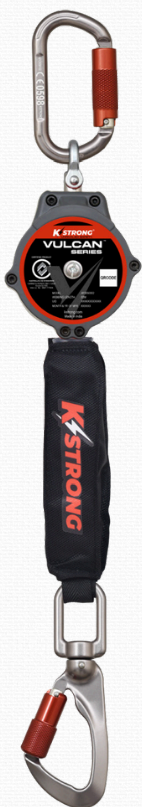
AFS550002 Vulcan SRL