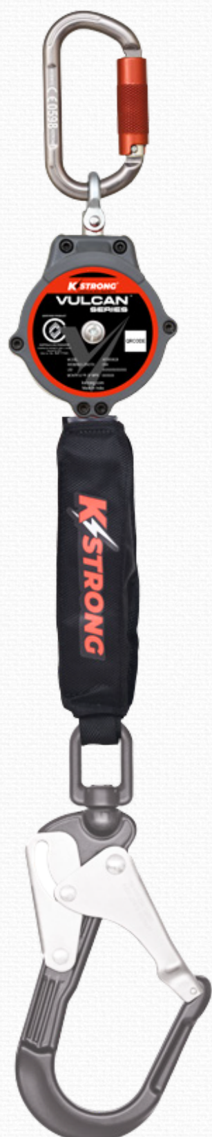
AFS550028 Vulcan SRL