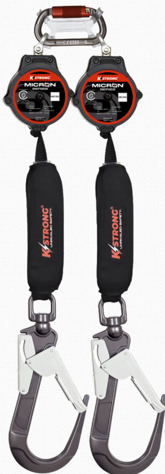
AFS550028D Twin Vulcan SRL