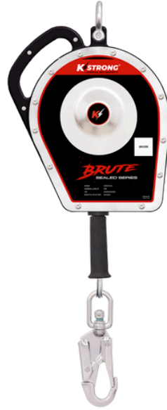
BRUTE SEALED RETRACTABLE FALL ARRESTER (20M) WITH ANSI STAINLESS STEEL SWIVEL SNAP HOOK & STAINLESS STEEL WIRE (AFS570020)