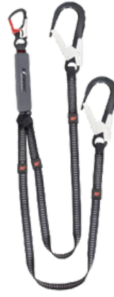
EPIC SHOCK ABSORBING LANYARD TWIN LEG 140KG 30MM WEBBING 1.8M C/W ALUMINIUM SNAP HOOK & ALUMINIUM SCAFFOLD HOOKS AT OTHER END (AFL406650(1.8M))