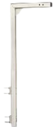
2M LADDER EXTENSION MOUNTING BRACKET FOR SEALED SRL'S (AFS57000LB)