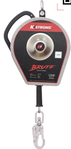
BRUTE SEALED RETRACTABLE FALL ARRESTER (30M) WITH ANSI STAINLESS STEEL SWIVEL SNAP HOOK & STAINLESS STEEL WIRE (AFS570030)