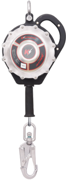
BRUTE SEALED RETRACTABLE FALL ARRESTER (10M) WITH ANSI STAINLESS STEEL SWIVEL SNAP HOOK & STAINLESS STEEL WIRE (AFS570010)