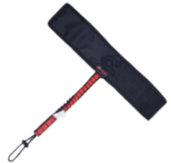
WRISTBAND TOOL HOLDER SWL 0.9KG (DA300401)