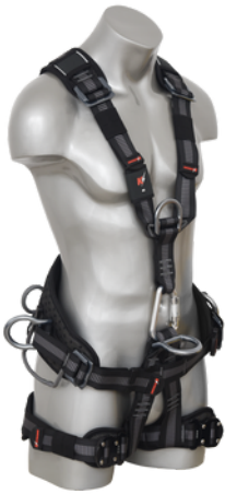
EPIC RESCUE HARNESS C/W ALUMINIUM FRONT & REAR D-RINGS, WORK POSITIONING WAIST BELT WITH SIDE D-RINGS, EQUIPMENT TOOL LOOP (AFH300404)