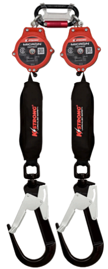
TWIN MICRON SRL 2 METER C/W ALUMINIUM SWIVEL SCAFFOLD HOOK (AFS550102D)