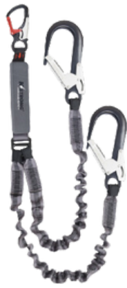
EPIC ELASTICATED SHOCK ABSORBING LANYARD TWIN LEG 140KG 1.8M C/W ALUMINIUM SNAP HOOK & ALUMINIUM SCAFFOLD HOOKS AT OTHER END (AFL408381(1.8M))