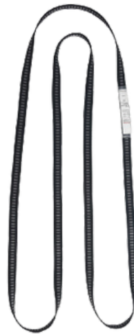
ANCHOR STRAP 23KN (AFA921515(1.5M))