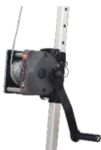
Winch (AFT730120 / AFT730140)