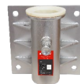
WALL Mounting bracket (AFT7500BW)