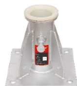
Floor mounting Bracket (AFT7500BF)