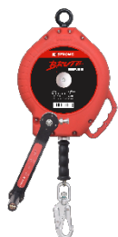
Retrieval Retractable Blocks (AFS510020R / AFS510030R)