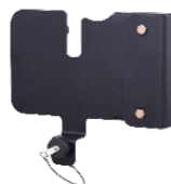
Davit Bracket (AFT7500B20) for AFS510020R