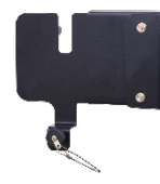
Davit Bracket (AFT7500B30) for AFS510030R