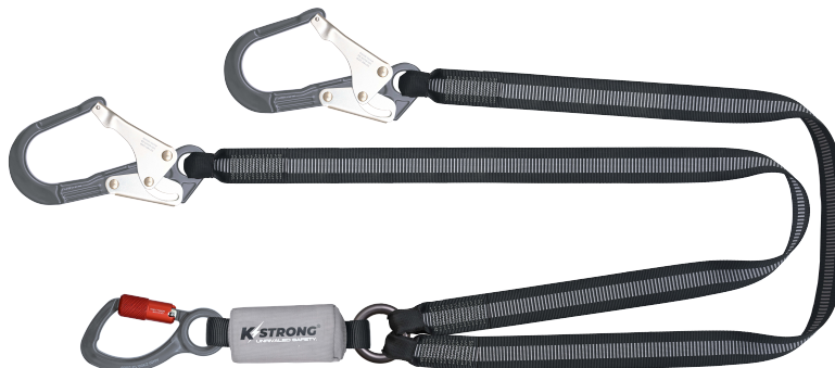
ENERGY ABSORBING 44MM DOUBLE LEG LANYARD