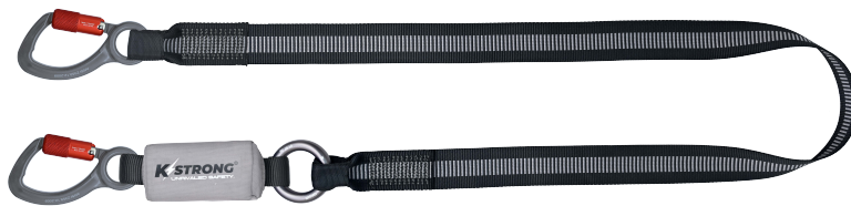
ENERGY ABSORBING 44MM WEBBING LANYARD