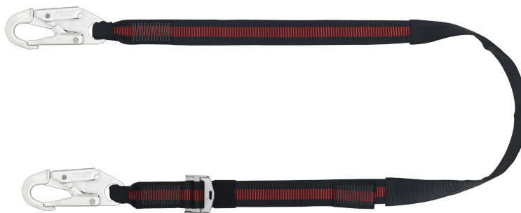
Pole Strap With Adjuster c/w Snap hooks - 3m