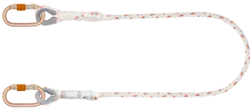
RESTRAINT TWISTED ROPE LANYARD