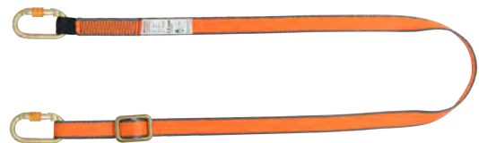
RESTRAINT WEBBING LANYARD