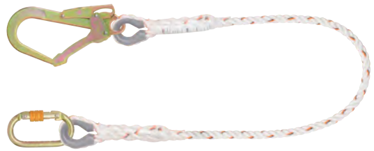
RESTRAINT TWISTED ROPE LANYARD