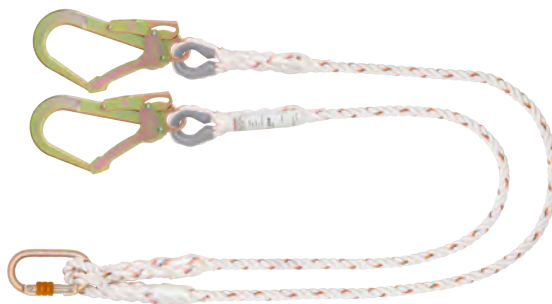
RESTRAINT TWISTED ROPE LANYARD