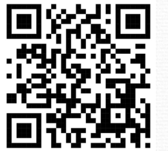
AFS550028 Micron SRL 2M