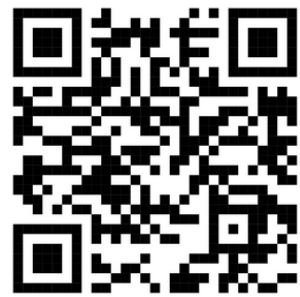
AFS551002(SW) Mini Block 2.5M