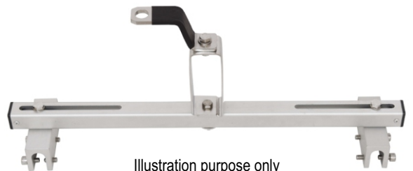
Illustration purpose only *** Impact post not include ***